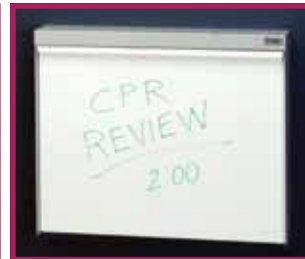
Painted White Board Finish